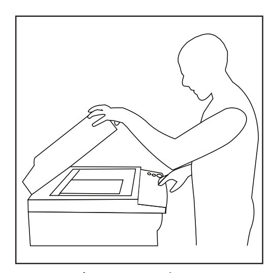
FIGURE 1. Photocopy template.